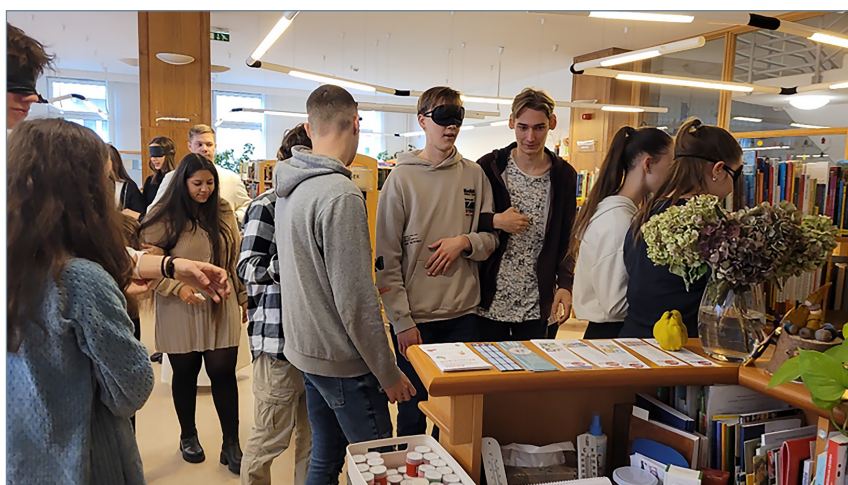
Fig. 2: "Volunteer blind" programme

"In 2016, we organized a computer training for the deaf and hard of hearing in our library."