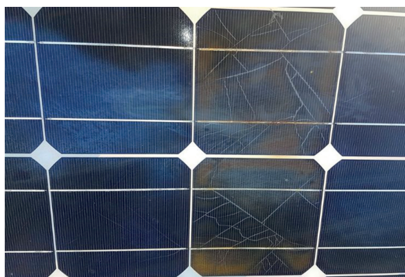
Figure 5. Tiny cracks on the surfaces [22]

During the manufacturing of solar panels, various materials and technologies are present that can contribute to the formation of microcracks in the manufacturing process. The quality of the materials used in the production of solar panels (e.g. silicon, glass) is of fundamental importance. Contaminants or defects in the materials, such as the use of improper types of silicon during manufacturing, can lead to the appearance of cracks. The production of silicon cells is based on thermal treatment processes, and improper execution of these processes can generate stresses, thereby increasing the risk of microcracks. Temperature fluctuations can also cause additional problems. Solar panels are exposed to various temperature conditions, which can significantly affect their performance and lifespan. The constant expansion and contraction caused by sunlight put serious stress on the solar panels.