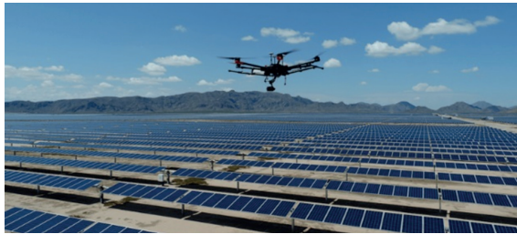
Figure 3. Checking a solar park using a drone [1]

to identify contaminated or shaded solar panels that reduce the park's performance. Drones equipped with thermal imaging systems are capable of mapping large solar farms in a single flight, capturing high-resolution RGB and thermal imaging images or videos [21]. Based on the heat maps made with the infrared camera, faulty modules or overheated connections can be identified. Inspection operations from the air are ongoing, especially in heated problem areas heavily exposed to the sun's rays, where technical teams face significant challenges. The use of drones allows operators to reduce inspection time by up to 70%, which is a significant time saving compared to traditional methods [12], [18].