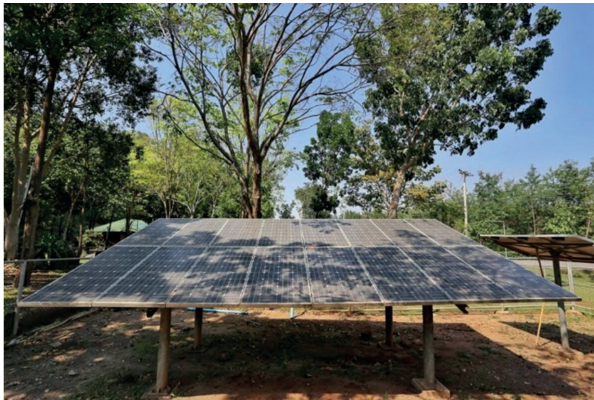
Figure 6. Shaded cells [10]

The variations in performance between the cells due to different shading levels can cause significant losses in energy production, reducing the overall energy output.