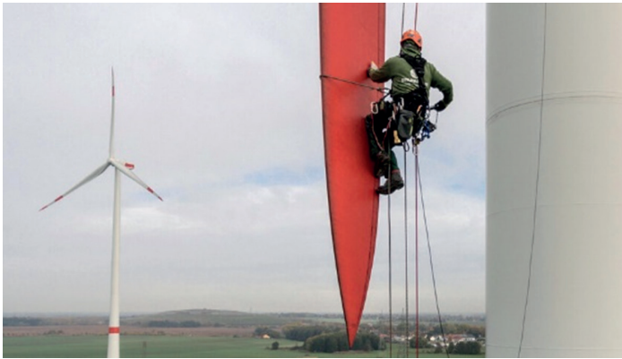
Figure 11. Application of rope technique [14]

The use of rope technology or platforms usually requires the presence of more than three specialists on site, which entails significant wage costs. The use of rope technique poses a high risk [16] for technicians, as they work at height, which increases the possibility of accidents and injuries. These methods are extremely time-consuming to implement, as technicians can only inspect one or two turbines per day. Working at heights carries additional risk factors that also increase insurance costs. The use of rope technology is influenced by weather conditions, such as intense winds or precipitation, which can hinder work and increase risks (Figure 11).