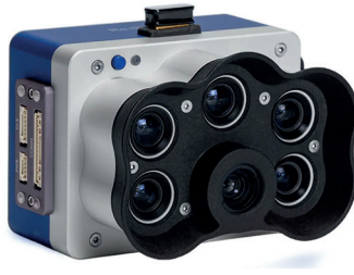
Figure 8. Multispectral drone camera [8]