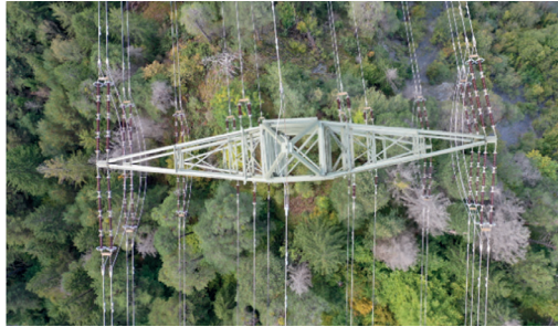
Figure 1. Vegetation near the wires [23]

Drones can conduct hazardous tasks, significantly reducing safety risks for workers and maintenance costs. Since potential problems can be detected earlier, major breakdowns can be avoided. Drone operations provide the collection of high-precision data based on which more accurate decisions can be made. Operations can even be tracked online, processes can be digitally recorded and evaluated later. Last but not least, thanks to the mostly electric drive, their ecological footprint is quite small [9], [11].