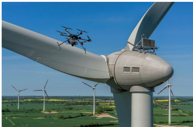
Figure 12. Inspection of wind turbines by X-ray technology [4]