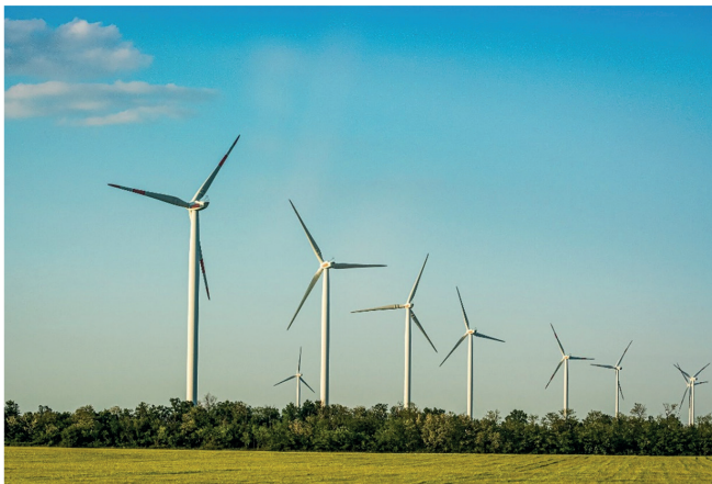
Figure 9. Wind farm in Mosonmagyaróvár [14]

Wind energy is one of the fastest-growing sources of renewable energy, with wind farms becoming increasingly larger and more complex. Turbines often exceed heights of one hundred meters, and blade lengths may surpass eighty meters (Figure 9).