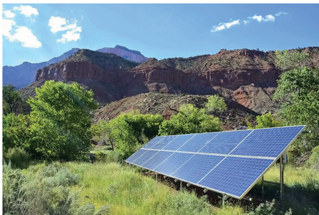
Figure 7. Solar panels installed on the ground [5]

Drones also capture data using conventional or RGB 1 cameras, which are important for providing information during condition assessments. The images obtained from the cameras can reveal visible physical damages such as broken, cracked, or displaced panels, as well as other external anomalies. They also effectively assist in identifying contaminants or deposits like dust, bird droppings, or leaves, which can significantly reduce the efficiency of the panels. Structural element inspections are common in assessments conducted with traditional cameras; however, beyond the panel-supporting scaffolding, there is also the opportunity to assess the condition of attachments, cabling pathways, or other infrastructural elements. When installed on the ground, the extent of any undergrowth is important, as it can potentially cause dangerous shading on panels mounted on low supports (Figure 7).