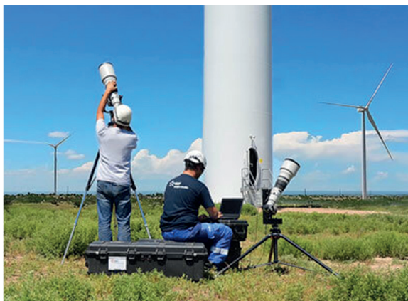
Figure 10. Inspection of wind turbines from the ground [25]

Inspection of the tower and foundation is usually conducted traditionally, using the rather dangerous rope technique, using platforms on platforms or visually observing them from the ground (see Figure 10).