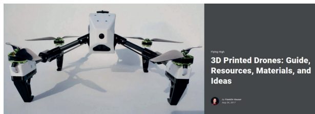
Figure 5. Web portal specialised in 3D printable UAVs [15]

3D printers can print the parts directly, allowing cheap and fast part production. It is also obvious that it is impossible to supervise/control all kinds of small UAVs, plans, parts, etc.