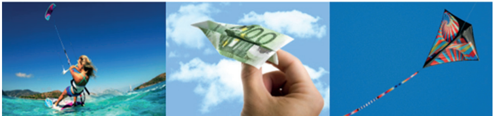
Figure 1. Interesting objects that can be classified as UAVs by the current Hungarian law [3]

According to the current (6 April 2016) Hungarian law (see Table 1), the following devices can also be identified or classified as an UAV (see Figure 1).