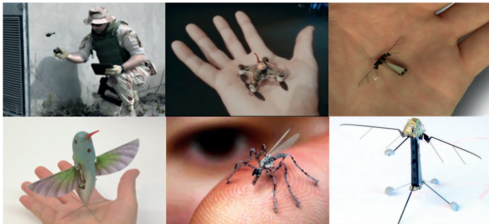
Figure 4. Unclassified light weight drones under 250 grams [3]

The UAVs shown in Figure 4 are all known to the public (not under secret R+D), all of them have special capabilities (spy drones, can do remote DNA sampling, lethal [suicide] attack missions, swarm technology [see description further], etc.). All these models are real, some of them are older than 10 years. Please remember for the right lower UAV, its weight is only 106 mg (much less than a gram), it will have importance later. We should not forget that today's technology is more developed, and this listing does not include classified newest R+D models.