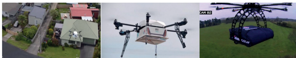
Figure 6. The world's first real food order delivery by a UAV (see the box winning system, avoiding landing over residential for safety and security reasons). The right picture shows an early model of the same company [3], [16], [17]

Besides classical military, law enforcement, SAR and agricultural air surveillance applications, UAVs are getting involved in daily trade and transport too (see Figure 6 and 7), they are becoming common in the near future. We hear news about the first services of different areas. For example, on 16 November 2016 Domino Pizza in Whangaparaoa, New Zealand completed the first order delivery, which was 2 pizzas (for scientific accuracy and keeping the credibility, let us note that the world's first UAV delivered food order was a "Peri-peri Chicken Pizza" and a "Chicken and Cranberry Pizza" [8]).