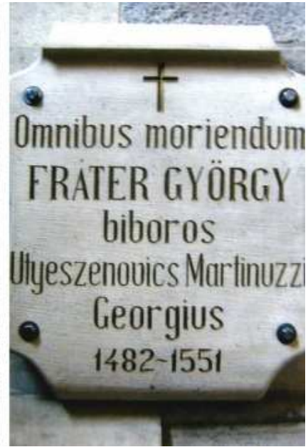
Ancient carving of Fráter György's assassination; "All are mortal" - memorial plaque in Gyulafehérvár cathedral

wanted him punished, but instead the king backed György and as a result, Majláth had to flee to avoid a death sentence.