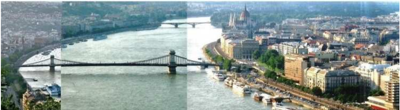
Budapest, view from the Citadella

... that Városliget (City Park) in Budapest is the first public park in the world? It has 302 acres, and its main entrance is the famous Hősök tere (Heroes' Square), one of Hungary's World Heritage sites.