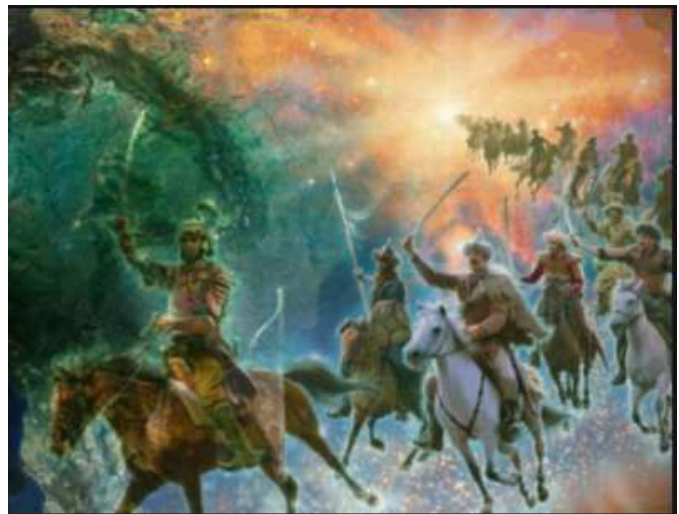
Top: The Milky Way, known in Hungarian as Hadak útja; Bottom: Csaba's troops coming by way of the Milky Way

So, it is not surprising that the name Csaba means "gift from the sky" or more simply "gift"! This legend explains it all! Furthermore, we also know that legends contain an element of truth, for they are connected to a historical incident or place. In this legend, the one thing that is certain and can be accepted is that the Huns are ancestors of the Székelys !