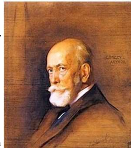
Statue of Görgei Artúr in the Vár district, Budapest (photo by EPF); portrait from Wikipedia