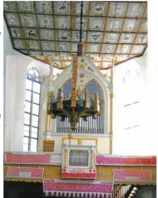
Church in Bánffyhunyard, with paneled ceiling

Then where did the pictographic message originate? From that variation of Christianity which existed already before Szt. István accepted Latin Christianity, and which lived on, having been passed on