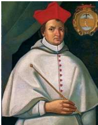
Cardinal Martinuzzi, known as Fráter György - 18th c. painting

In 1503, he went on to Szepes Castle, which is in present-day Slovakia. He served as a page and then Guard of the Palace under Hedwig of Cieszyn, the widow of Count Zápolya Ist-