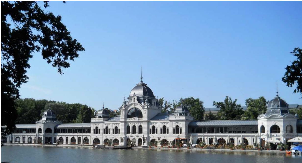
Top left: Molnár János Cave; top right and bottom: Városliget (City Park)