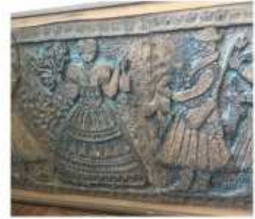
Top: "Rugby", "Pilgrims"; Center: "Trees", "Abstract", "The Brook in Winter"; Bottom (not in exhibit): Mother and Child sculpture, Arany János (illustration in "A Sampler of Hungarian Poetry"), bas-relief