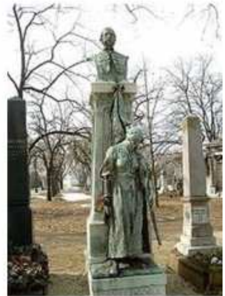
Irányi Dániel in his later years; his memorial in the Kerepesi úti cemetery

This was the headline of the petition publicized throughout the city. Leaders of the Youth of March were Petőfi Sándor, Jókai Mór, Vasvári Pál, Irinyi József, followed by many others.