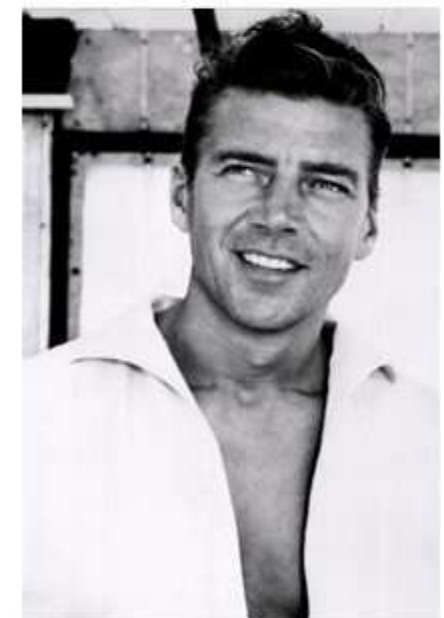
Simon Böske, Hargitay Mickey