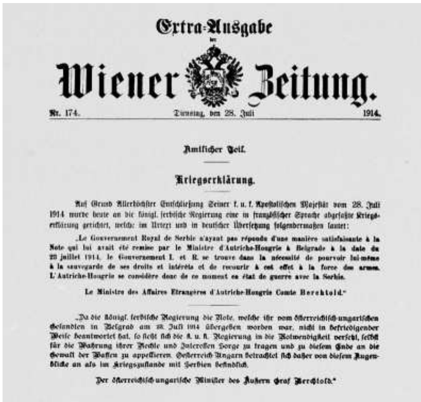
Text of the declaration of war in the Viennese newspaper "Wiener Zeitung":