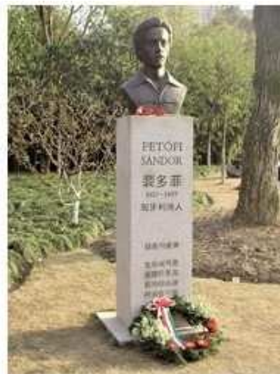
Dedication of Petőfi statue in Chongqing; Petőfi statue in Shanghai