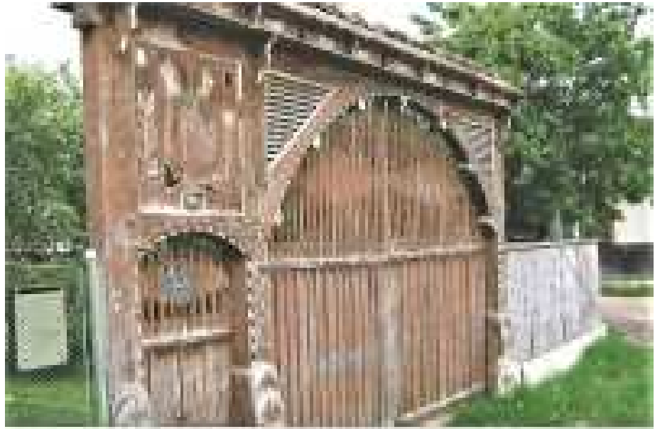
Carved gate in Csíkszentdomokos

A székelykapu consists of a smaller walk-in gate – known as kiskapu or little gate – for use by people, and a wide and latticed high gate, nagykapu or large gate – that will accommodate wagons piled high with hay. The dimensions of the nagykapu are about twelve and a half feet by twelve and a half feet. A dovecote always runs atop the entire width of the nagykapu , and is sometimes found even over the kiskapu , which measures about 3 feet wide and about 6 feet high. (On my two trips, I never saw a dove on any székelykapu !) Next to the walk-in gate there may be a small bench (sometimes called a szakállszárító or “beard drier”) with an overhang. That is where the owner and his wife might sit