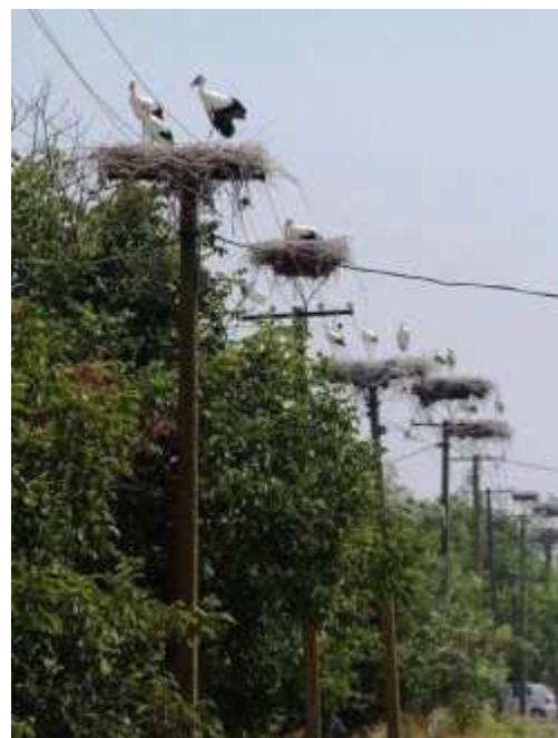
Storks in Tiszatarros

Many traditions are tied to Szent Gergely's - St. Gregory's - day (March 12 th ). This is the day when the legumes (beans, peas) should be planted. In Szamoshat, that's the day the bees are let out. But beekeepers must not look to the sky, or the bees will fly high! Snow is not unusual on that day, then it is said Gergely is shaking his beard.