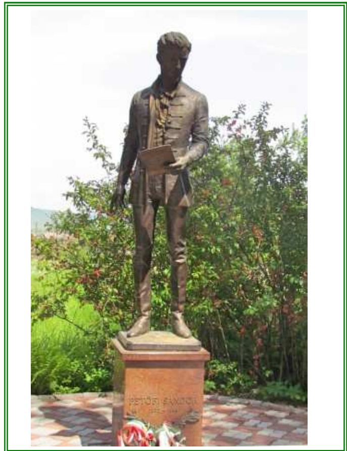
Statue of Petőfi Sándor at Fehéregyháza, Transylvania, not far from the scene of battle where he disappeared.

Ha meghalok, ha meghalok A vérpadon vagy csatatéren, Lesz, a ki majd holttestemről Könyüivel lemossa vérem!