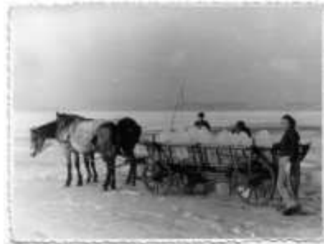
Cutting blocks of ice on the lake