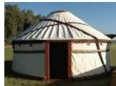
Construction phases of the Magyar Yurt