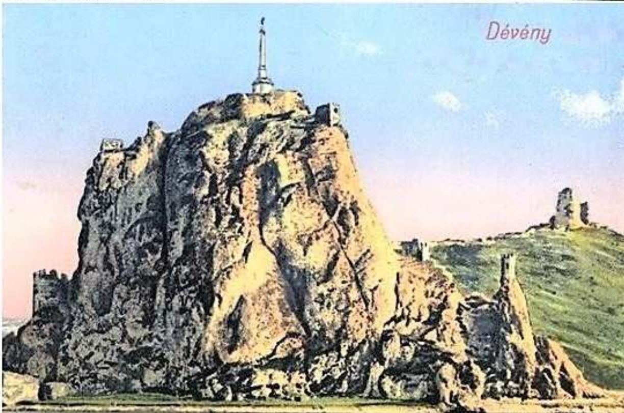
Top: Zimony, Zobor, Pusztaszer; Center: Brassó, Pannonhalma, Munkács; Bottom: Dévény