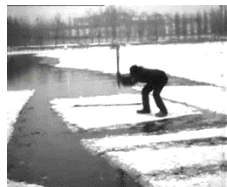
Ice cutter on the Danube