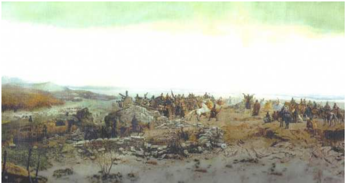
A part of the panoramic Feszty körkép, taken from a printed copy

The base of the obelisk was round, and the memorial was dedicated to Huba, one of the seven Chieftains who led the Hungarians in the Conquest. It was ceremoniously unveiled in 1896.