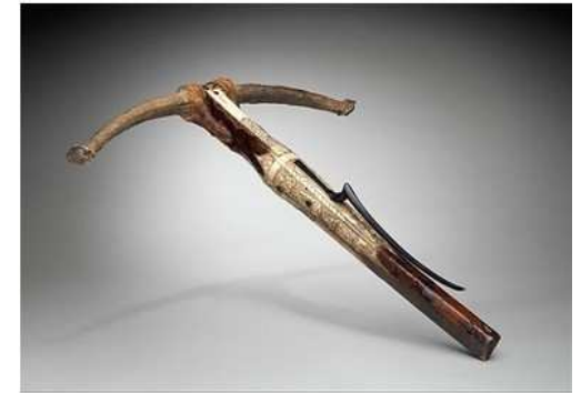
Caption: Stefansdom in Vienna; glazed colored tiles associated with Mátyás király; crossbow of Mátyás király in Metropolitan Museum of Art, NYC

king, beloved by the common people, as related in endless legends.