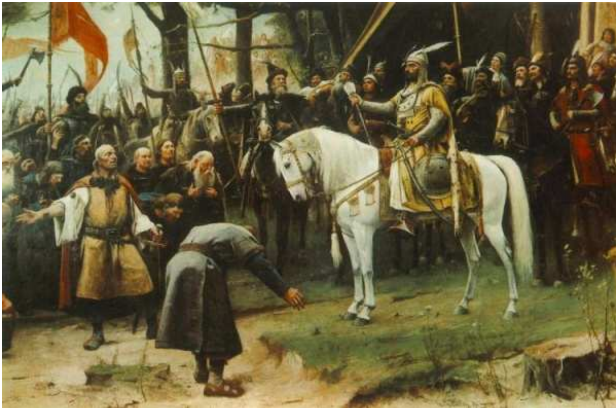
Munkácsy Mihály : Honfoglalás

important grains included millet, barley and wheat.