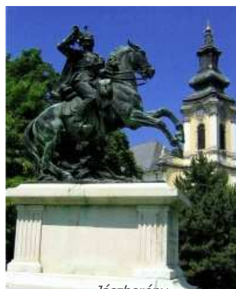
Jászberény World War I memorial

The locals believe that Attila's grave is located in Jászberény . And visitors can see, in the museum, Lehel's Horn, which has become the emblem of the city (see article "Lehel's Horn – "Lehel kürtje" elsewhere in this issue).