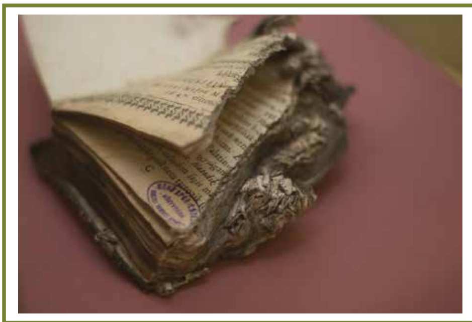
The Székely Chronicle before restoration