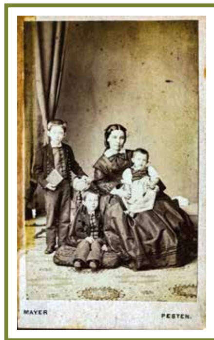
Mrs. Árpád Horvát, née Júlia Szendrey and her children (photograph)

patonai.agnes.at.oszk.hu, szuts-novak.rita.at.oszk.hu